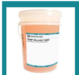
5-gallon pail SKU: MS685LF-5G UPC-12: 641238067368