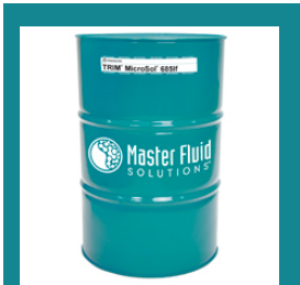
54-gallon drum SKU: MS685LF-54G UPC-12: 641238067375