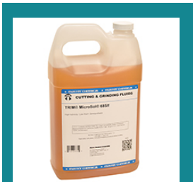
1-gallon jug SKU: MS685LF-1G UPC-12: 641238067344