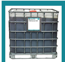
270-gallon tote SKU: MS685LF-270G UPC-12: 641238067382