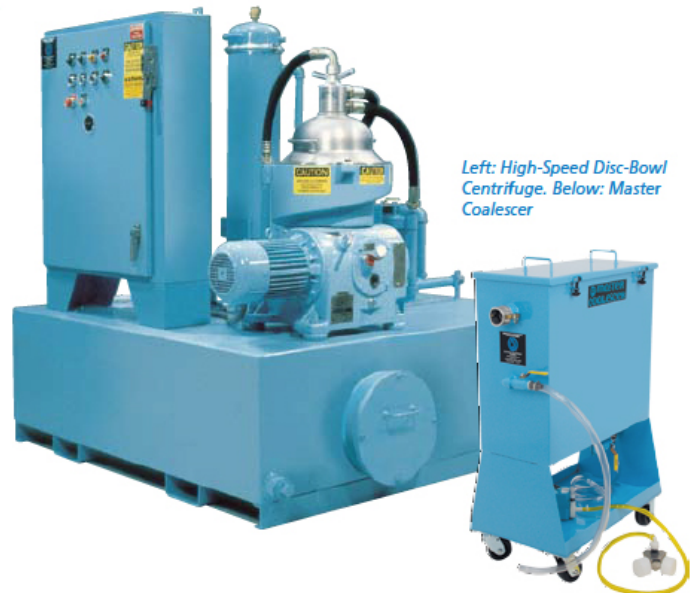
Left: High-Speed Disc-Bowl Centrifuge. Below: Master Coalescer

Coalescers will remove both dispersed and free tramp oil . They are, in effect, special tanks where oleophilic (oil attracting) media or plates coalesce (merge small oil droplets into large oil droplets) the dispersed oil so that it can be skimmed off. These coalescers increase the effective size of the sump and as flow rates are low there is plenty of quiescent time for the oil to "split out" and rise to the surface. Coalescers are very effective when the tramp oils are not readily soluble in the working solution. Even a small amount of detergency in either the fluid or the oil will reduce the effectiveness of a coalescer. The classic use for coalescers is to separate "bilge and ballast" water (often salt water) from residual and spilled oil in the bilges and tanks. The efficiency of coalescers is similar to that of a settling tank with a similar retention time.