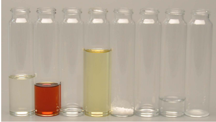
A typical Master Fluid Solutions emulsion concentrate is comprised of 8 ingredients.