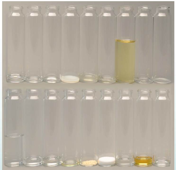
A typical Master Fluid Solutions microemulsion concentrate is comprised of 18 ingredients and though it is clearly a very complex formula, it does not contain any unnecessary ingredients.

The target working solution, also called coolant concentration, for any specific machine will depend on variables including the manufacturer's recommended working range, the materials being used, the operation being performed, and the amount of lubrication and cooling needed. Working solutions are adjustable: if less lubricity is needed, a lower concentration may be appropriate; if more lubricity is needed, a higher concentration may be required. Once a target working solution is determined, it is important to monitor its fluid concentration level and make adjustments to keep it as close to target as possible. In order to check the concentration of your working solution after the initial sump fill, you use Brix factors and your refractometer reading.