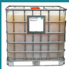
270-gallon tote SKU: WHMXXT-270G UPC-12: 641238070771

Master STAGES™ Whamex XT™ | ©2011-2026 Master Fluid Solutions® | 2026-01-29