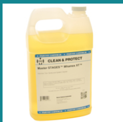
1-gallon jug SKU: WHMXXT-1G UPC-12: 641238069416