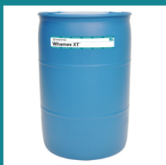
54-gallon drum SKU: WHMXXT-54G UPC-12: 641238069393