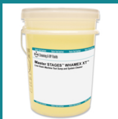
5-gallon pail SKU: WHMXXT-5G UPC-12: 641238069409