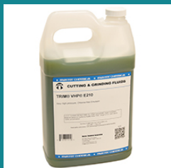
1-gallon jug SKU: VHPE210-1G UPC-12: 641238012016