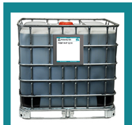
270-gallon tote SKU: VHPE210-270G UPC-12: 641238034285

TRIM ® VHP ® E210 | ©1993-2025 Master Fluid Solutions ® | 2025-01-28