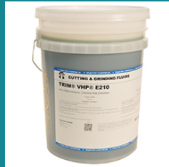
5-gallon pail SKU: VHPE210-5G UPC-12: 641238012047