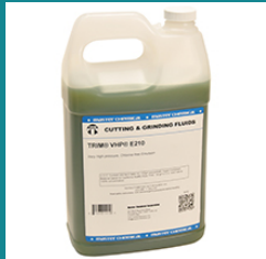
1-gallon jug SKU: VHPE210-1G UPC-12: 641238012016