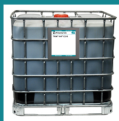
270-gallon tote SKU: VHPE210-270G UPC-12: 641238034285