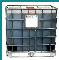
270-gallon tote SKU: VHPE210-270G UPC-12: 641238034285

TRIM® VHP® E210 | ©1994-2024 Master Fluid Solutions® | 2024-04-16