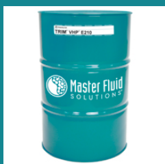
54-gallon drum SKU: VHPE210-54G UPC-12: 641238012054