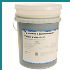
5-gallon pail SKU: VHPE210-5G UPC-12: 641238012047