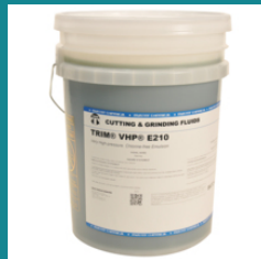
5-gallon pail SKU: VHPE210-5G UPC-12: 641238012047