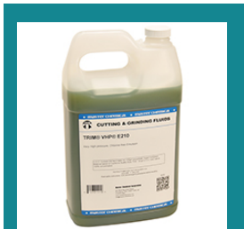
1-gallon jug SKU: VHPE210-1G UPC-12: 641238012016