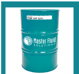
54-gallon drum SKU: VHPE210-54G UPC-12: 641238012054