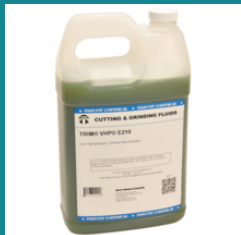
1-gallon jug SKU: VHPE210-1G UPC-12: 641238012016