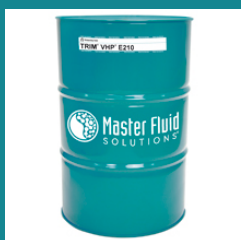
54-gallon drum SKU: VHPE210-54G UPC-12: 641238012054