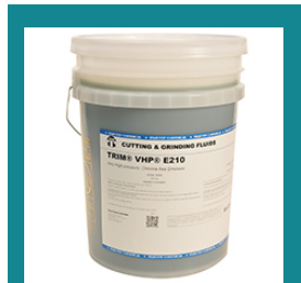
5-gallon pail SKU: VHPE210-5G UPC-12: 641238012047