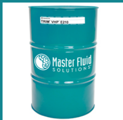
54-gallon drum SKU: VHPE210-54G UPC-12: 641238012054