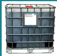
270-gallon tote SKU: VHPE210-270G UPC-12: 641238034285

TRIM® VHP® E210 | ©1993-2025 Master Fluid Solutions® | 2025-04-22