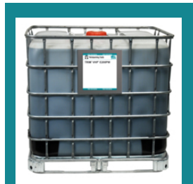
270-gallon tote SKU: VHPE200P-270G UPC-12: 641238036180