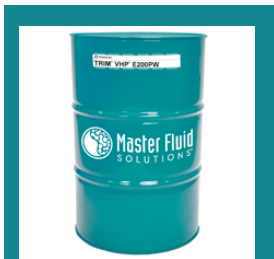
54-gallon drum SKU: VHPE200P-54G UPC-12: 641238011934