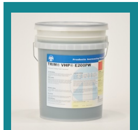
5-gallon pail SKU: VHPE200P-5G UPC-12: 641238011927