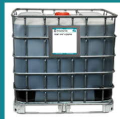
270-gallon tote SKU: VHPE200P-270G UPC-12: 641238036180