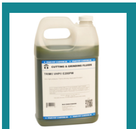
1-gallon jug SKU: VHPE200P-1G UPC-12: 641238024118