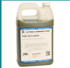
1-gallon jug SKU: VHPE200P-1G UPC-12: 641238024118