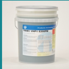
5-gallon pail SKU: VHPE200P-5G UPC-12: 641238011927