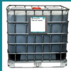
270-gallon tote SKU: VHPE200P-270G UPC-12: 641238036180