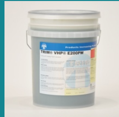
5-gallon pail SKU: VHPE200P-5G UPC-12: 641238011927