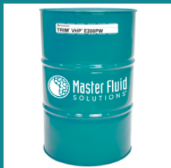
54-gallon drum SKU: VHPE200P-54G UPC-12: 641238011934