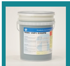
5-gallon pail SKU: VHPE200P-5G UPC-12: 641238011927