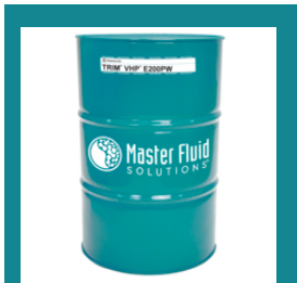
54-gallon drum SKU: VHPE200P-54G UPC-12: 641238011934