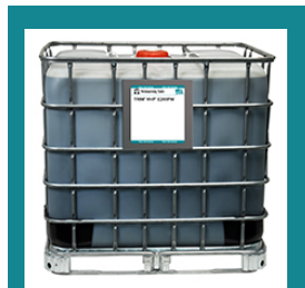
270-gallon tote SKU: VHPE200P-270G UPC-12: 641238036180

TRIM® VHP® E200PW | ©1993-2024 Master Fluid Solutions® | 2024-11-21