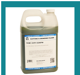
1-gallon jug SKU: VHPE200P-1G UPC-12: 641238024118