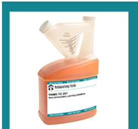
2-quart tip "N" measure ® SKU: TC251-2Q UPC-12: 641238077916