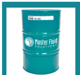
54-gallon drum SKU: TC251-54G UPC-12: 641238077091