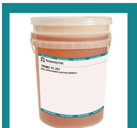
5-gallon pail SKU: TC251-5G UPC-12: 641238077084