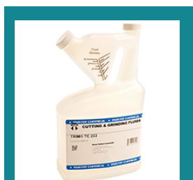
2-quart tip "N" measure ® SKU: TC233-2Q UPC-12: 641238023203