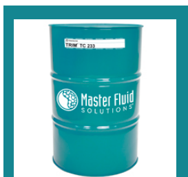
54-gallon drum SKU: TC233-54G UPC-12: 641238023234