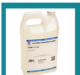
1-gallon jug SKU: TC233-1G UPC-12: 641238039730