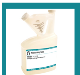
2-quart tip "N" measure ® SKU: TC211-2Q UPC-12: 641238074144