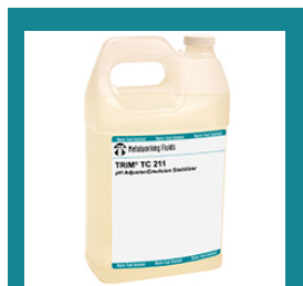
1-gallon jug SKU: TC211-1G UPC-12: 641238032281