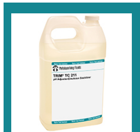
1-gallon jug SKU: TC211-1G UPC-12: 641238032281