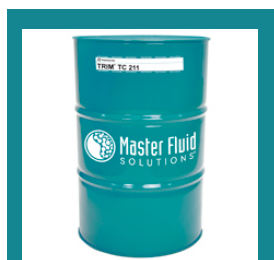
54-gallon drum SKU: TC211-54G UPC-12: 641238010944