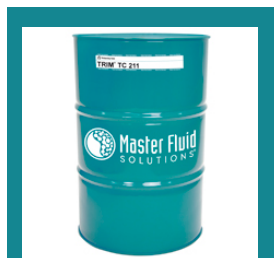
54-gallon drum SKU: TC211-54G UPC-12: 641238010944