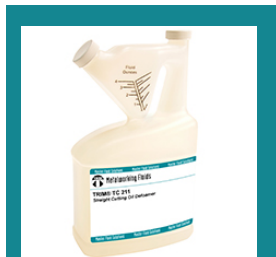
2-quart tip "N" measure ® SKU: TC211-2Q UPC-12: 641238074144