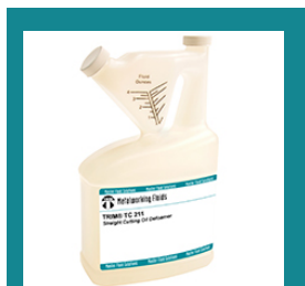
2-quart tip "N" measure ® SKU: TC211-2Q UPC-12: 641238074144