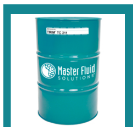
54-gallon drum SKU: TC211-54G UPC-12: 641238010944