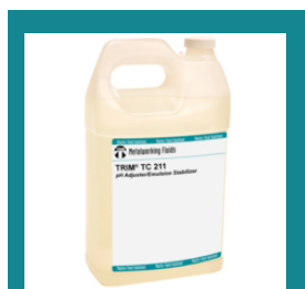
1-gallon jug SKU: TC211-1G UPC-12: 641238032281