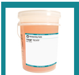
5-gallon pail SKU: TC177-5G UPC-12: 641238010234