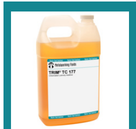
1-gallon jug SKU: TC177-1G UPC-12: 641238074267