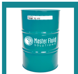
54-gallon drum SKU: TC177-54G UPC-12: 641238010241