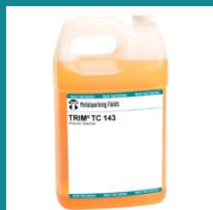
1-gallon jug SKU: TC143-1G UPC-12: 641238009696