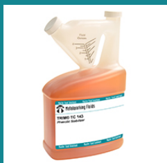
2-quart tip "N" measure ® SKU: TC143-2Q UPC-12: 641238009726