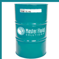
54-gallon drum SKU: TC143-54G UPC-12: 641238009757