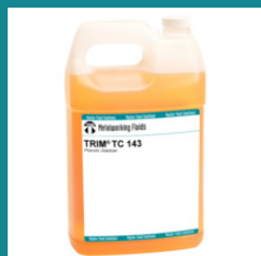
1-gallon jug SKU: TC143-1G UPC-12: 641238009696