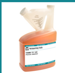
2-quart tip "N" measure ® SKU: TC143-2Q UPC-12: 641238009726