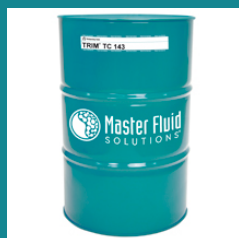
54-gallon drum SKU: TC143-54G UPC-12: 641238009757