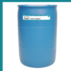
54-gallon drum SKU: TASK2GF-54G UPC-12: 641238031352

Master STAGES™ Task2™ GF | ©2008-2026 Master Fluid Solutions® | 2026-02-01