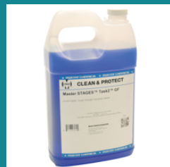
1-gallon jug SKU: TASK2GF-1G UPC-12: 641238031321