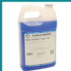
1-gallon jug SKU: TASK2GF-1G UPC-12: 641238031321