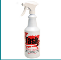
1-quart bottle SKU: TASK2GF-QT UPC-12: 641238030195