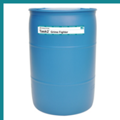
54-gallon drum SKU: TASK2GF-54G UPC-12: 641238031352

Master STAGES™ Task2™ GF | ©2008-2025 Master Fluid Solutions® | 2025-12-14