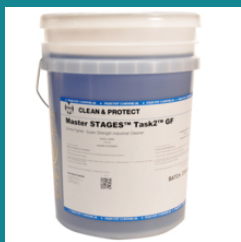
5-gallon pail SKU: TASK2GF-5G UPC-12: 641238031345