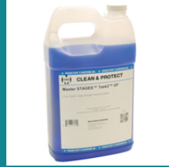
1-gallon jug SKU: TASK2GF-1G UPC-12: 641238031321