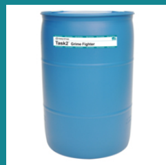
54-gallon drum SKU: TASK2GF-54G UPC-12: 641238031352

Master STAGES™ Task2™ GF | ©2008-2026 Master Fluid Solutions® | 2026-06-29