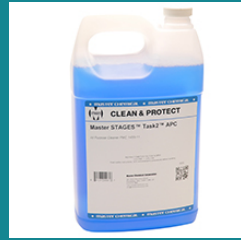
1-gallon jug SKU: TASK2APC-1G UPC-12: 641238000617