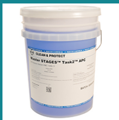
5-gallon pail SKU: TASK2APC-5G UPC-12: 641238000655