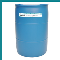
54-gallon drum SKU: TASK2APC-54G UPC-12: 641238047384

Master STAGES™ Task2™ APC | ©2008-2024 Master Fluid Solutions® | 2024-11-21