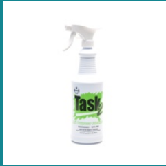
1-quart bottle SKU: TASK2APC-QT UPC-12: 641238047407