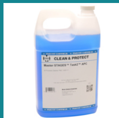
1-gallon jug SKU: TASK2APC-1G UPC-12: 641238000617