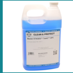
1-gallon jug SKU: TASK2APC-1G UPC-12: 641238000617