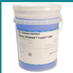
5-gallon pail SKU: TASK2APC-5G UPC-12: 641238000655