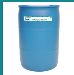
54-gallon drum SKU: TASK2APC-54G UPC-12: 641238047384

Master STAGES™ Task2™ APC | ©2008-2026 Master Fluid Solutions® | 2026-06-19