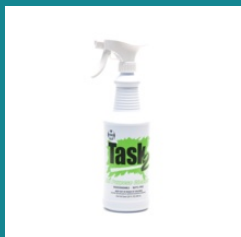
1-quart bottle SKU: TASK2APC-QT UPC-12: 641238047407