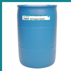
54-gallon drum SKU: TASK2APC-54G UPC-12: 641238047384

Master STAGES™ Task2™ APC | ©2008-2025 Master Fluid Solutions® | 2025-12-14