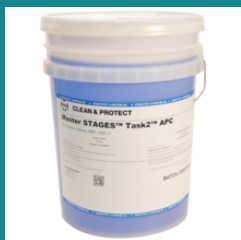
5-gallon pail SKU: TASK2APC-5G UPC-12: 641238000655