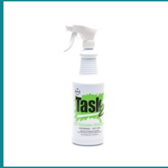
1-quart bottle SKU: TASK2APC-QT UPC-12: 641238047407