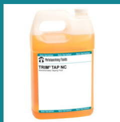
1-gallon jug SKU: TAPNC-1G UPC-12: 641238009337