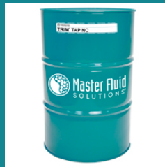
54-gallon drum SKU: TAPNC-54G UPC-12: 641238009399