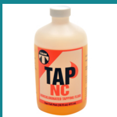
1-pint bottle SKU: TAPNC-1P UPC-12: 641238009429