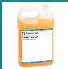
1-gallon jug SKU: TAPNC-1G UPC-12: 641238009337