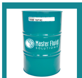
54-gallon drum SKU: TAPNC-54G UPC-12: 641238009399