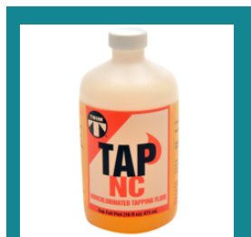
1-pint bottle SKU: TAPNC-1P UPC-12: 641238009429