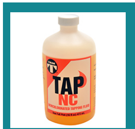
1-pint bottle SKU: TAPNC-1P UPC-12: 641238009429