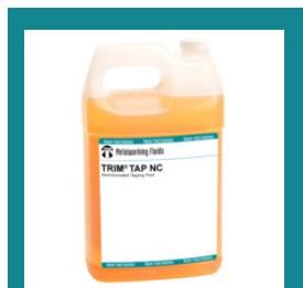
1-gallon jug SKU: TAPNC-1G UPC-12: 641238009337