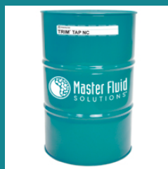
54-gallon drum SKU: TAPNC-54G UPC-12: 641238009399