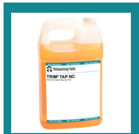
1-gallon jug SKU: TAPNC-1G UPC-12: 641238009337