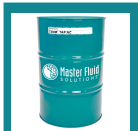
54-gallon drum SKU: TAPNC-54G UPC-12: 641238009399