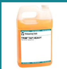
1-gallon jug SKU: TAPHVY-1G UPC-12: 641238008989