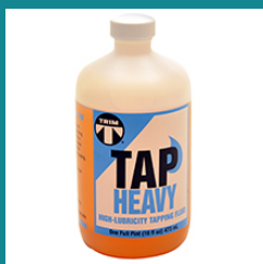
1-pint bottle SKU: TAPHVY-1P UPC-12: 641238009078