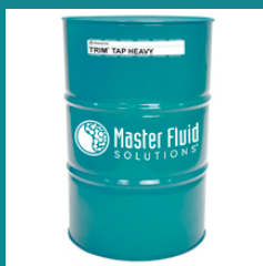
54-gallon drum SKU: TAPHVY-54G UPC-12: 641238009047