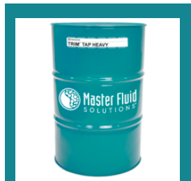
54-gallon drum SKU: TAPHVY-54G UPC-12: 641238009047