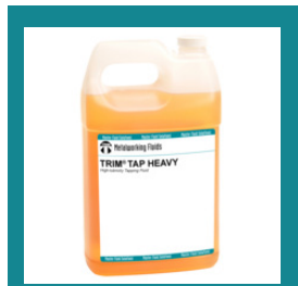
1-gallon jug SKU: TAPHVY-1G UPC-12: 641238008989