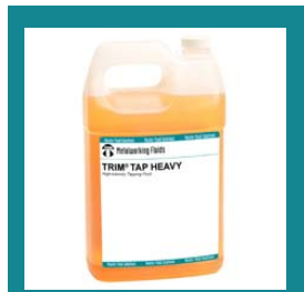
1-gallon jug SKU: TAPHVY-1G UPC-12: 641238008989