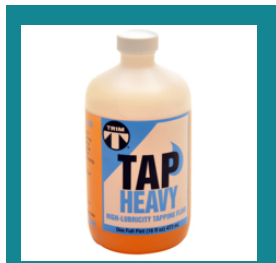
1-pint bottle SKU: TAPHVY-1P UPC-12: 641238009078