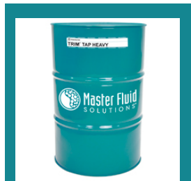
54-gallon drum SKU: TAPHVY-54G UPC-12: 641238009047