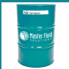
54-gallon drum SKU: TAPHVY-54G UPC-12: 641238009047