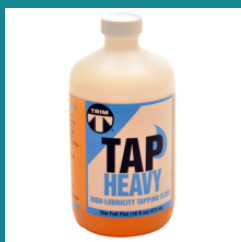
1-pint bottle SKU: TAPHVY-1P UPC-12: 641238009078