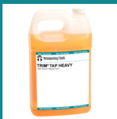
1-gallon jug SKU: TAPHVY-1G UPC-12: 641238008989