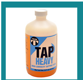
1-pint bottle SKU: TAPHVY-1P UPC-12: 641238009078