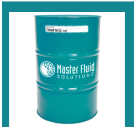
54-gallon drum SKU: SOLND-54G UPC-12: 641238008736