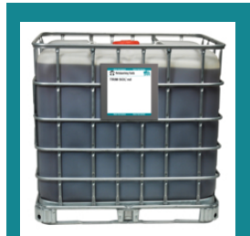
270-gallon tote SKU: SOLND-270G UPC-12: 641238034230