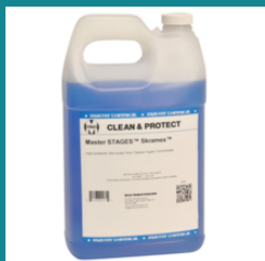
1-gallon jug SKU: SKRAMEX-1G UPC-12: 641238022923