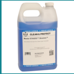
1-gallon jug SKU: SKRAMEX-1G UPC-12: 641238022923