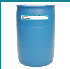
54-gallon drum SKU: SKRAMEX-54G UPC-12: 641238022954