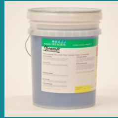
5-gallon pail SKU: SKRAMEX-5G UPC-12: 641238022947