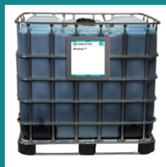
270-gallon tote SKU: SKRAMEX-270G UPC-12: 641238023012

Master STAGES™ Skramex™ | ©1998-2026 Master Fluid Solutions® | 2026-02-03