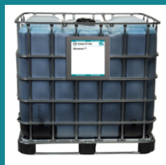
270-gallon tote SKU: SKRAMEX-270G UPC-12: 641238023012

Master STAGES™ Skramex™ | ©1998-2025 Master Fluid Solutions® | 2025-12-14