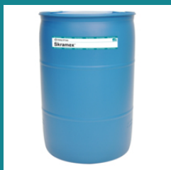
54-gallon drum SKU: SKRAMEX-54G UPC-12: 641238022954