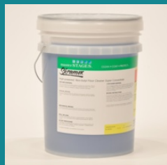
5-gallon pail SKU: SKRAMEX-5G UPC-12: 641238022947