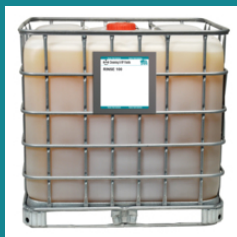
270-gallon tote SKU: RNS100-270G UPC-12: 641238034148

Master STAGES™ RINSE 100 | ©2004-2025 Master Fluid Solutions® | 2025-12-15