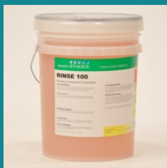
5-gallon pail SKU: RNS100-5G UPC-12: 641238006985