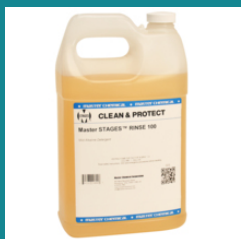
1-gallon jug SKU: RNS100-1G UPC-12: 641238006947