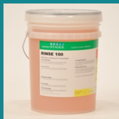
5-gallon pail SKU: RNS100-5G UPC-12: 641238006985