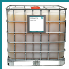
270-gallon tote SKU: RNS100-270G UPC-12: 641238034148

Master STAGES™ RINSE 100 | ©2004-2026 Master Fluid Solutions® | 2026-01-31