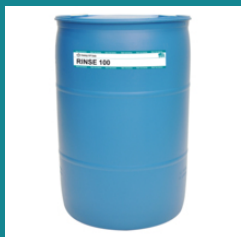
54-gallon drum SKU: RNS100-54G UPC-12: 641238006992