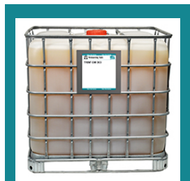
270-gallon tote SKU: OM303-270G UPC-12: 641238033820