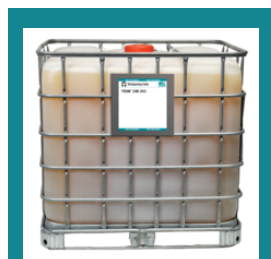
270-gallon tote SKU: OM303-270G UPC-12: 641238033820