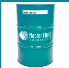
54-gallon drum SKU: OM303-54G UPC-12: 641238005957