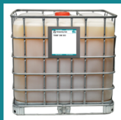
270-gallon tote SKU: OM303-270G UPC-12: 641238033820