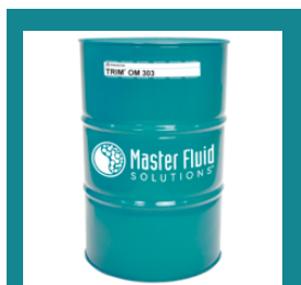
54-gallon drum SKU: OM303-54G UPC-12: 641238005957