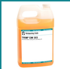
1-gallon jug SKU: OM303-1G UPC-12: 641238005919