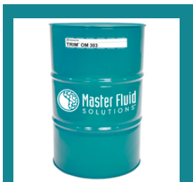
54-gallon drum SKU: OM303-54G UPC-12: 641238005957