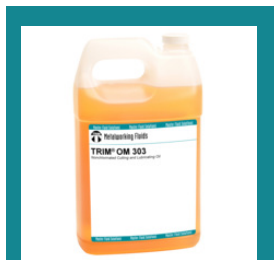
1-gallon jug SKU: OM303-1G UPC-12: 641238005919