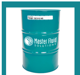
54-gallon drum SKU: OE315NS-54G UPC-12: 641238076667