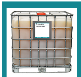
270-gallon tote SKU: OE315NS-270G UPC-12: 641238077565