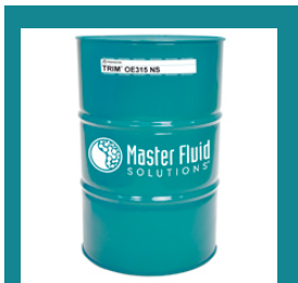
54-gallon drum SKU: OE315NS-54G UPC-12: 641238076667