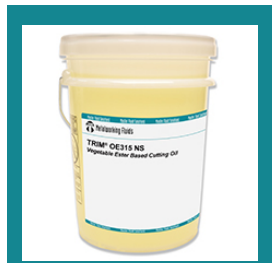
5-gallon pail SKU: OE315NS-5G UPC-12: 641238077527