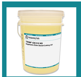
5-gallon pail SKU: OE310NS-5G UPC-12: 641238077473