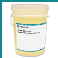
5-gallon pail SKU: OE310NS-5G UPC-12: 641238077473