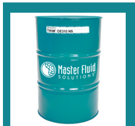
54-gallon drum SKU: OE310NS-54G UPC-12: 641238076728