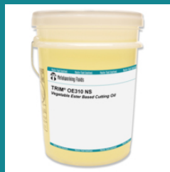
5-gallon pail SKU: OE310NS-5G UPC-12: 641238077473