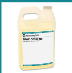
1-gallon jug SKU: OE310NS-1G UPC-12: 641238077497