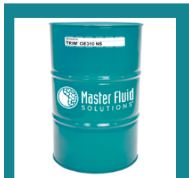
54-gallon drum SKU: OE310NS-54G UPC-12: 641238076728