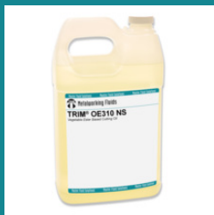
1-gallon jug SKU: OE310NS-1G UPC-12: 641238077497