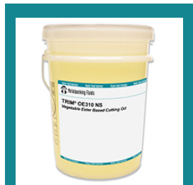
5-gallon pail SKU: OE310NS-5G UPC-12: 641238077473