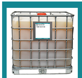
270-gallon tote SKU: OE310NS-270G UPC-12: 641238077510