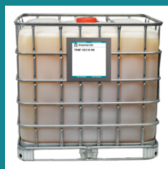
270-gallon tote SKU: OE310NS-270G UPC-12: 641238077510