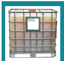
270-gallon tote SKU: OE310NS-270G UPC-12: 641238077510