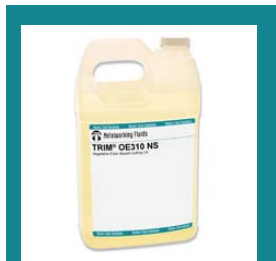
1-gallon jug SKU: OE310NS-1G UPC-12: 641238077497