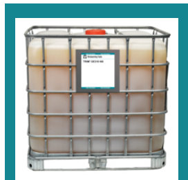
270-gallon tote SKU: OE310NS-270G UPC-12: 641238077510