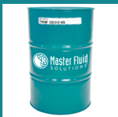
54-gallon drum SKU: OE310NS-54G UPC-12: 641238076728