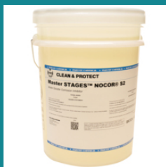
5-gallon pail SKU: NOCORS2-5G UPC-12: 641238042235