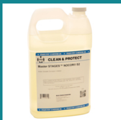
1-gallon jug SKU: NOCORS2-1G UPC-12: 641238043010