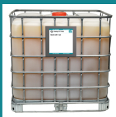
270-gallon tote SKU: NOCORS2-270G UPC-12: 641238042273