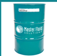
54-gallon drum SKU: NOCORS2-54G UPC-12: 641238042242