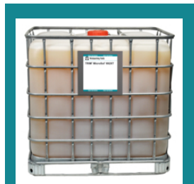
270-gallon tote SKU: MS692XT-270G UPC-12: 641238080145