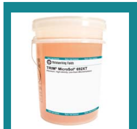
5-gallon pail SKU: MS692XT-5G UPC-12: 641238080121