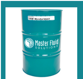
54-gallon drum SKU: MS692XT-54G UPC-12: 641238080114