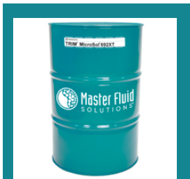
54-gallon drum SKU: MS692XT-54G UPC-12: 641238080114