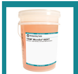
5-gallon pail SKU: MS692XT-5G UPC-12: 641238080121