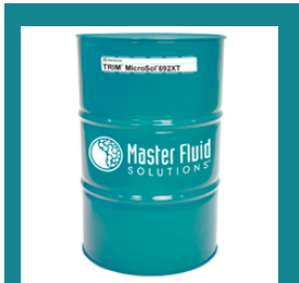
54-gallon drum SKU: MS692XT-54G UPC-12: 641238080114