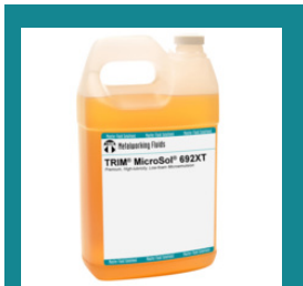
1-gallon jug SKU: MS692XT-1G UPC-12: 641238080138