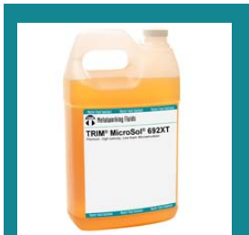
1-gallon jug SKU: MS692XT-1G UPC-12: 641238080138