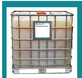
270-gallon tote SKU: MS692XT-270G UPC-12: 641238080145