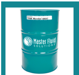
54-gallon drum SKU: MS690XT-54G UPC-12: 641238073000