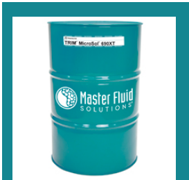
54-gallon drum SKU: MS690XT-54G UPC-12: 641238073000