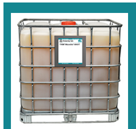
270-gallon tote SKU: MS690XT-270G UPC-12: 641238073017