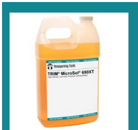
1-gallon jug SKU: MS690XT-1G UPC-12: 641238072973