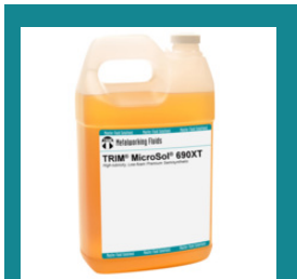
1-gallon jug SKU: MS690XT-1G UPC-12: 641238072973