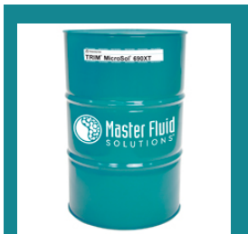
54-gallon drum SKU: MS690XT-54G UPC-12: 641238073000