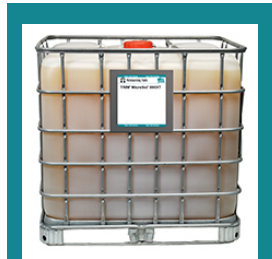
270-gallon tote SKU: MS690XT-270G UPC-12: 641238073017