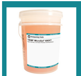
5-gallon pail SKU: MS690XT-5G UPC-12: 641238072997