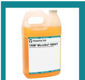
1-gallon jug SKU: MS690XT-1G UPC-12: 641238072973