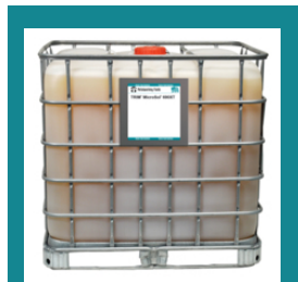
270-gallon tote SKU: MS690XT-270G UPC-12: 641238073017