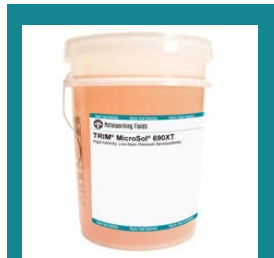
5-gallon pail SKU: MS690XT-5G UPC-12: 641238072997