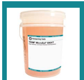
5-gallon pail SKU: MS690XT-5G UPC-12: 641238072997