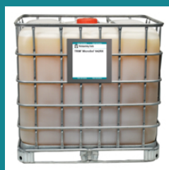
270-gallon tote SKU: MS642RX-270G UPC-12: 641238081524