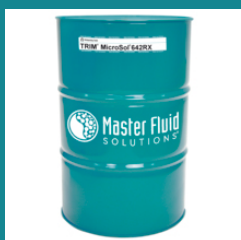
54-gallon drum SKU: MS642RX-54G UPC-12: 641238081487