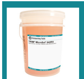
5-gallon pail SKU: MS642RX-5G UPC-12: 641238081494