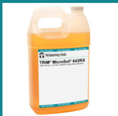
1-gallon jug SKU: MS642RX-1G UPC-12: 641238081500