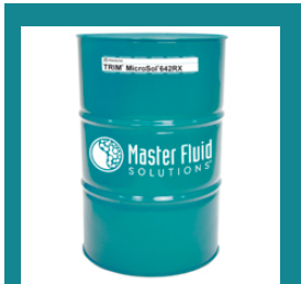
54-gallon drum SKU: MS642RX-54G UPC-12: 641238081487