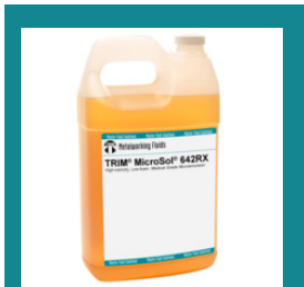
1-gallon jug SKU: MS642RX-1G UPC-12: 641238081500