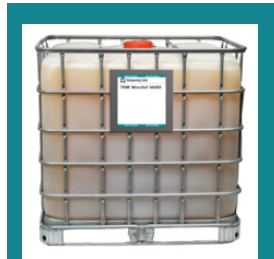
270-gallon tote SKU: MS642RX-270G UPC-12: 641238081524