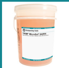
5-gallon pail SKU: MS642RX-5G UPC-12: 641238081494