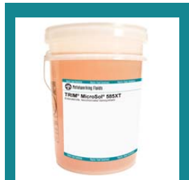
5-gallon pail SKU: MS585XT-5G UPC-12: 641238065821