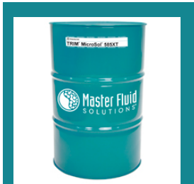
54-gallon drum SKU: MS585XT-54G UPC-12: 641238065814