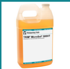
1-gallon jug SKU: MS585XT-1G UPC-12: 641238065838