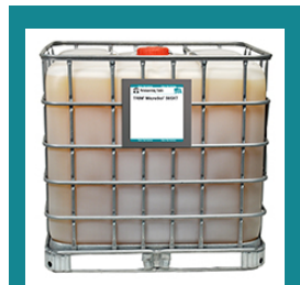
270-gallon tote SKU: MS585XT-270G UPC-12: 641238065852