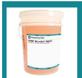
5-gallon pail SKU: MS585XT-5G UPC-12: 641238065821