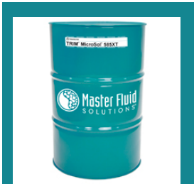
54-gallon drum SKU: MS585XT-54G UPC-12: 641238065814