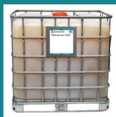
270-gallon tote SKU: MS585XT-270G UPC-12: 641238065852