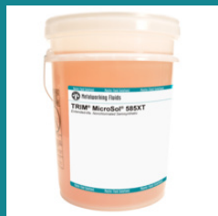
5-gallon pail SKU: MS585XT-5G UPC-12: 641238065821