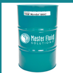
54-gallon drum SKU: MS585XT-54G UPC-12: 641238065814