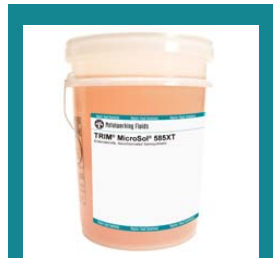
5-gallon pail SKU: MS585XT-5G UPC-12: 641238065821