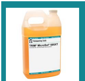
1-gallon jug SKU: MS585XT-1G UPC-12: 641238065838