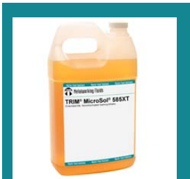
1-gallon jug SKU: MS585XT-1G UPC-12: 641238065838