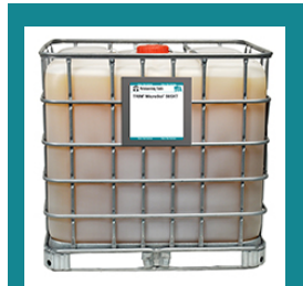
270-gallon tote SKU: MS585XT-270G UPC-12: 641238065852