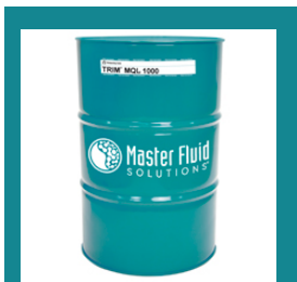
54-gallon drum SKU: MQL1000-54G UPC-12: 641238038597