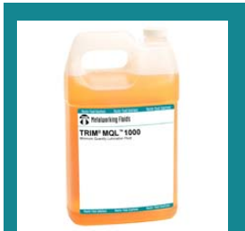
1-gallon jug SKU: MQL1000-1G UPC-12: 641238038559