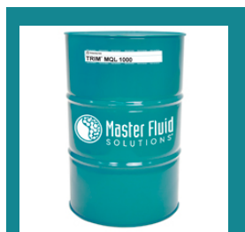
54-gallon drum SKU: MQL1000-54G UPC-12: 641238038597