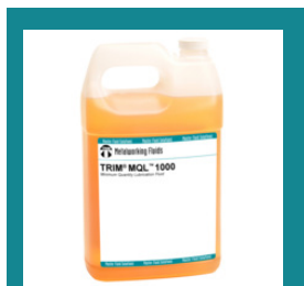
1-gallon jug SKU: MQL1000-1G UPC-12: 641238038559