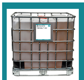
270-gallon tote SKU: MQL1000-270G UPC-12: 641238074779