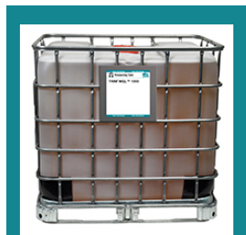
270-gallon tote SKU: MQL1000-270G UPC-12: 641238074779