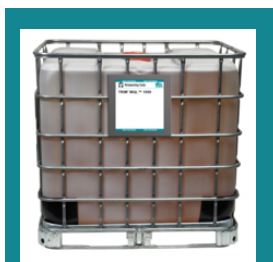
270-gallon tote SKU: MQL1000-270G UPC-12: 641238074779