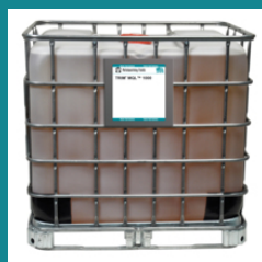
270-gallon tote SKU: MQL1000-270G UPC-12: 641238074779