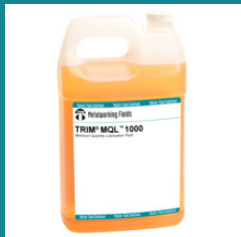
1-gallon jug SKU: MQL1000-1G UPC-12: 641238038559