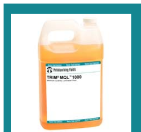
1-gallon jug SKU: MQL1000-1G UPC-12: 641238038559