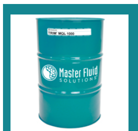
54-gallon drum SKU: MQL1000-54G UPC-12: 641238038597