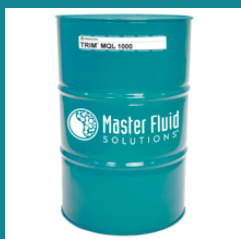
54-gallon drum SKU: MQL1000-54G UPC-12: 641238038597