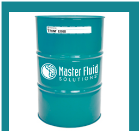
54-gallon drum SKU: E860-54G UPC-12: 641238081876