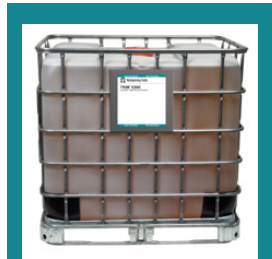
270-gallon tote SKU: E860-270G UPC-12: 641238081883