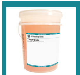
5-gallon pail SKU: E860-5G UPC-12: 641238081869