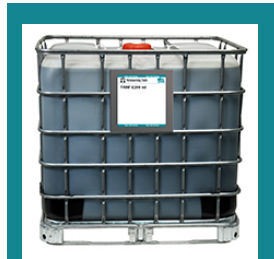
270-gallon tote SKU: E206ND-270G UPC-12: 641238034063