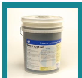
5-gallon pail SKU: E206ND-5G UPC-12: 641238003151