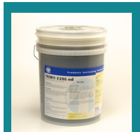
5-gallon pail SKU: E206ND-5G UPC-12: 641238003151