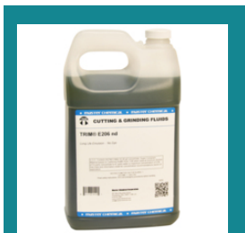
1-gallon jug SKU: E206ND-1G UPC-12: 641238003144