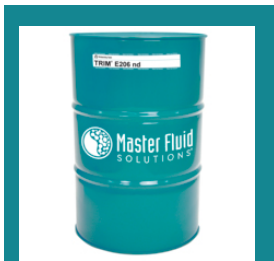
54-gallon drum SKU: E206ND-54G UPC-12: 641238003168