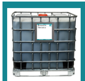
270-gallon tote SKU: E206ND-270G UPC-12: 641238034063