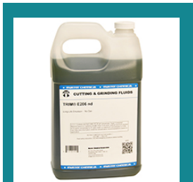
1-gallon jug SKU: E206ND-1G UPC-12: 641238003144