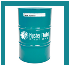
54-gallon drum SKU: E206ND-54G UPC-12: 641238003168