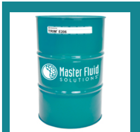
54-gallon drum SKU: E206-54G UPC-12: 641238003090