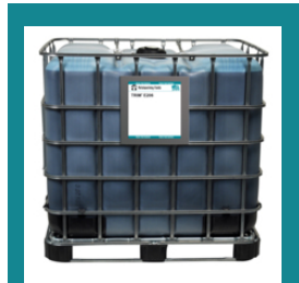
270-gallon tote SKU: E206-270G UPC-12: 641238033882