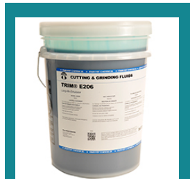
5-gallon pail SKU: E206-5G UPC-12: 641238003083