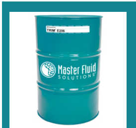
54-gallon drum SKU: E206-54G UPC-12: 641238003090