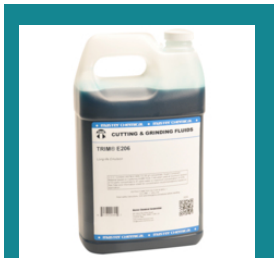
1-gallon jug SKU: E206-1G UPC-12: 641238003052