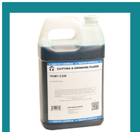
1-gallon jug SKU: E206-1G UPC-12: 641238003052