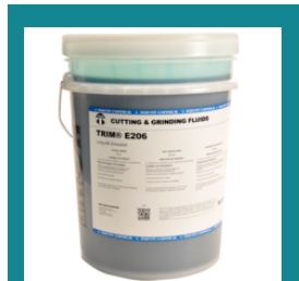
5-gallon pail SKU: E206-5G UPC-12: 641238003083