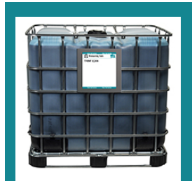
270-gallon tote SKU: E206-270G UPC-12: 641238033882