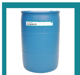
54-gallon drum SKU: CLEANF2-54G UPC-12: 641238020035