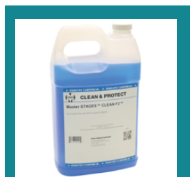
1-gallon jug SKU: CLEANF2-1G UPC-12: 641238020004