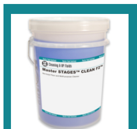
5-gallon pail SKU: CLEANF2-5G UPC-12: 641238020028