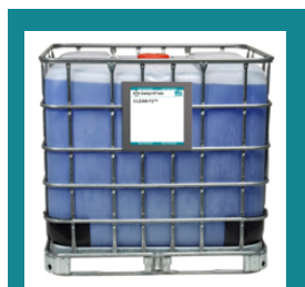
270-gallon tote SKU: CLEANF2-270G UPC-12: 641238034032

Master STAGES™ CLEAN F2™ | ©2004-2026 Master Fluid Solutions® | 2026-06-23