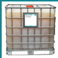
270-gallon tote SKU: CL2430-270G UPC-12: 641238041849

Master STAGES™ CLEAN 2430 | ©2005-2026 Master Fluid Solutions® | 2026-06-22