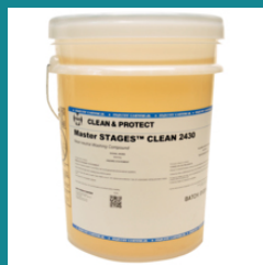
5-gallon pail SKU: CL2430-5G UPC-12: 641238041801