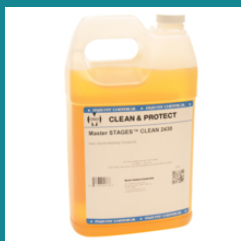
1-gallon jug SKU: CL2430-1G UPC-12: 641238041788