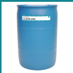
54-gallon drum SKU: CL2430-54G UPC-12: 641238041818