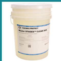
5-gallon pail SKU: CL2029-5G UPC-12: 641238002109