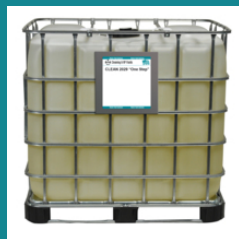
270-gallon tote SKU: CL2029-270G UPC-12: 641238033837

Master STAGES™ CLEAN 2029 'One Step' | ©2003-2026 Master Fluid Solutions® | 2026-06-22