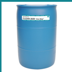
54-gallon drum SKU: CL2029-54G UPC-12: 641238002116