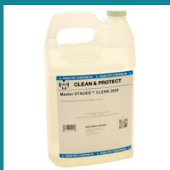
1-gallon jug SKU: CL2029-1G UPC-12: 641238019909