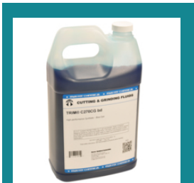
1-gallon jug SKU: C270CGB-1G UPC-12: 641238042822