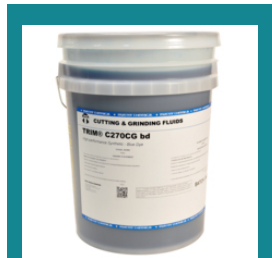
5-gallon pail SKU: C270CGB-5G UPC-12: 641238042846