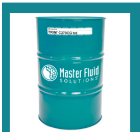
54-gallon drum SKU: C270CGB-54G UPC-12: 641238042853