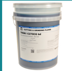
5-gallon pail SKU: C270CGB-5G UPC-12: 641238042846