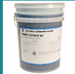
5-gallon pail SKU: C270CGB-5G UPC-12: 641238042846