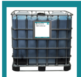
270-gallon tote SKU: C270CGB-270G UPC-12: 641238042860