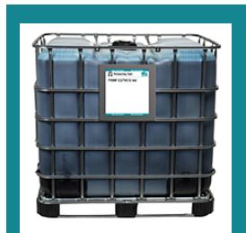
270-gallon tote SKU: C270CGB-270G UPC-12: 641238042860