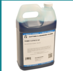
1-gallon jug SKU: C270CGB-1G UPC-12: 641238042822