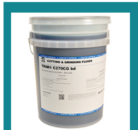
5-gallon pail SKU: C270CGB-5G UPC-12: 641238042846