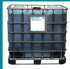
270-gallon tote SKU: C270CGB-270G UPC-12: 641238042860