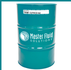
54-gallon drum SKU: C270CGB-54G UPC-12: 641238042853