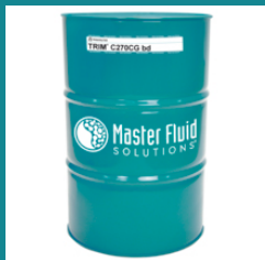
54-gallon drum SKU: C270CGB-54G UPC-12: 641238042853