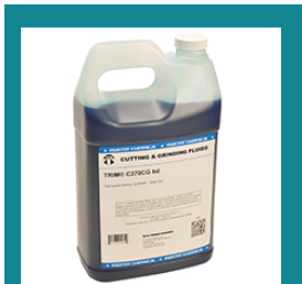
1-gallon jug SKU: C270CGB-1G UPC-12: 641238042822