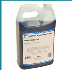
1-gallon jug SKU: C270CGB-1G UPC-12: 641238042822