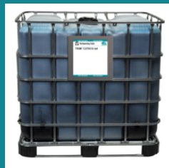
270-gallon tote SKU: C270CGB-270G UPC-12: 641238042860