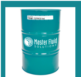
54-gallon drum SKU: C270CGB-54G UPC-12: 641238042853