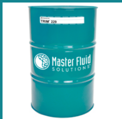
54-gallon drum SKU: 229-54G UPC-12: 641238000051