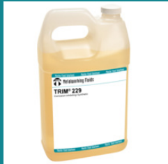
1-gallon jug SKU: 229-1G UPC-12: 641238000013