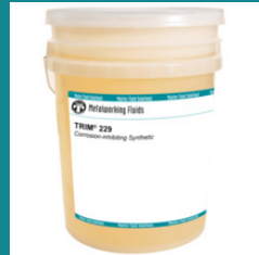
5-gallon pail SKU: 229-5G UPC-12: 641238000044