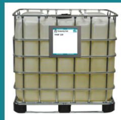
270-gallon tote SKU: 229-270G UPC-12: 641238033899