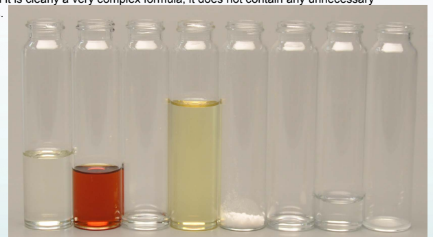
A typical Master Fluid Solutions emulsion concentrate is comprised of 8 ingredients.