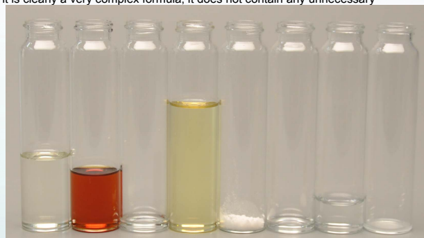
A typical Master Fluid Solutions emulsion concentrate is comprised of 8 ingredients.