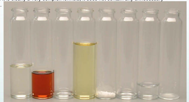
A typical Master Fluid Solutions emulsion concentrate is comprised of 8 ingredients.