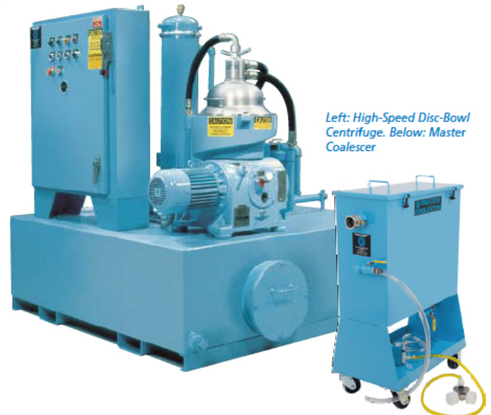
Left: High-Speed Disc-Bowl Centrifuge. Below: Master Coalescer

Coalescers will remove both dispersed and free tramp oil. They are, in effect, special tanks where oleophilic (oil attracting) media or plates coalesce (merge small oil droplets into large oil droplets) the dispersed oil so that it can be skimmed off. These coalescers increase the effective size of the sump and as flow rates are low there is plenty of quiescent time for the oil to "split out" and rise to the surface. Coalescers are very effective when the tramp oils are not readily soluble in the working solution. Even a small amount of detergency in either the fluid or the oil will reduce the effectiveness of a coalescer. The classic use for coalescers is to separate "bilge and ballast" water (often salt water) from residual and spilled oil in the bilges and tanks. The efficiency of coalescers is similar to that of a settling tank with a similar retention time.